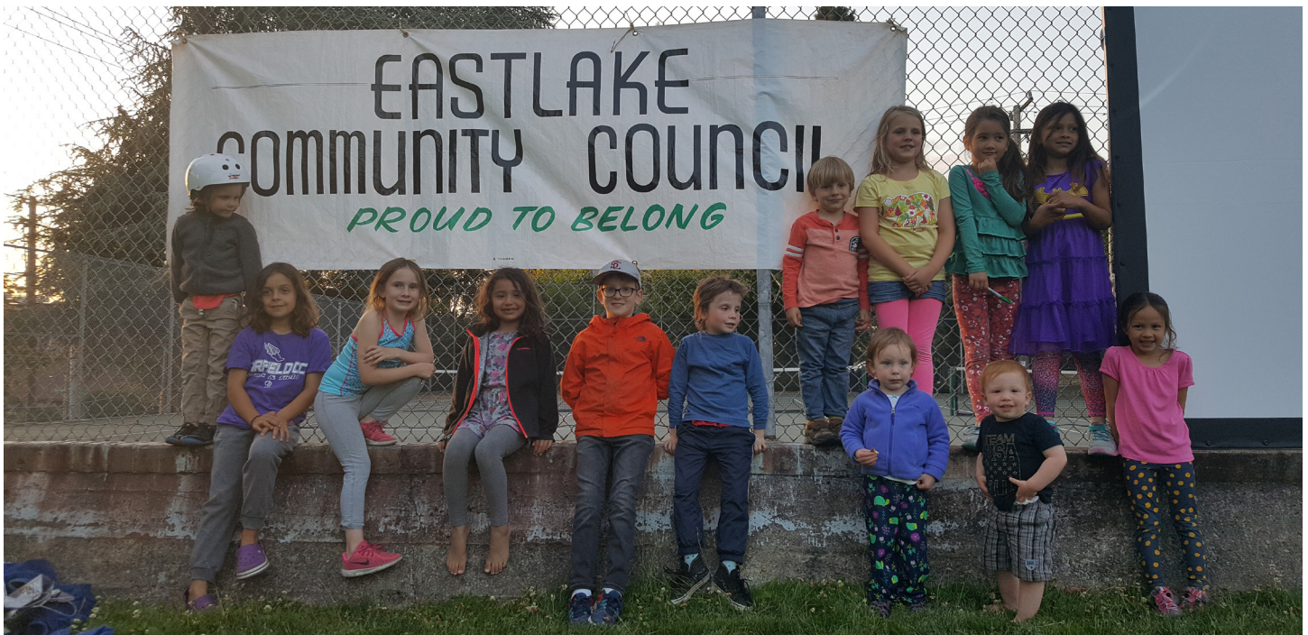
The Eastlake outdoor movie is a summer highlight for young and old alike. Thank you to the businesses whose donations make it possible.

Union Pilates [2712 Eastlake Ave., (206) 617-5552, http://unionpilates.com ]. Offering tower and mat Pilates in small group and private sessions. ... "Our mission at Union is to help individuals feel better in their body. To accomplish this we strive to teach people how to use and understand their body's needs through the teachings and practice Joseph Pilates created. We believe that by understanding and becoming more present in our bodies that we are able to live healthier, happier lives."