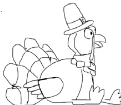
Blow up Thanksgiving turkey seen on Franklin Avenue Sketch by Karen Berry

The lack of a sidewalk between the stairs on Lakeview Avenue East came up - a petition was circulated to support seeking city funds for the construction of the sidewalk and potentially a retaining wall as well. One attendee said he would rather City