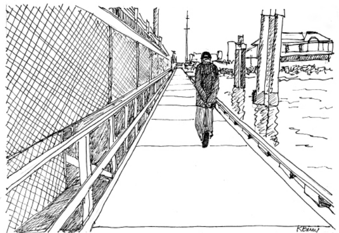
The floating walkway will be coming back.