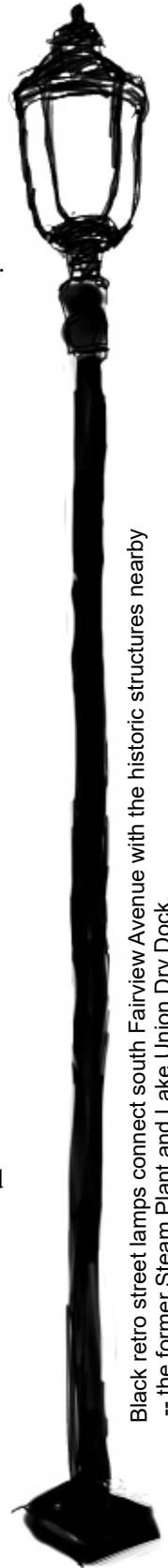
Black retro street lamps connect south Fairview Avenue with the historic structures nearby -- the former Steam Plant and Lake Union Dry Dock.

Fairview Avenue E. is unusually narrow at this undeveloped street end, unsafe for pedestrians and for enjoying views of the lake. As its steepness would not easily accommodate a park, the 1998 Eastlake Neighborhood Plan proposes a cantilevered pedestrian walkway to allow safe passage and views while preserving the street-end's greenery.