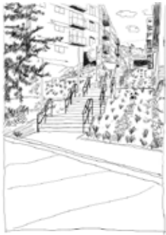
New Howe Street stairs.

The Howe Street right-of-way does not reach the lake, but it does connect Eastlake Avenue to Fairview. A coalition of community volunteers successfully campaigned for a public stairway, recently constructed, that further lengthens the Howe Street steps (already the City's longest) down from Capitol Hill.