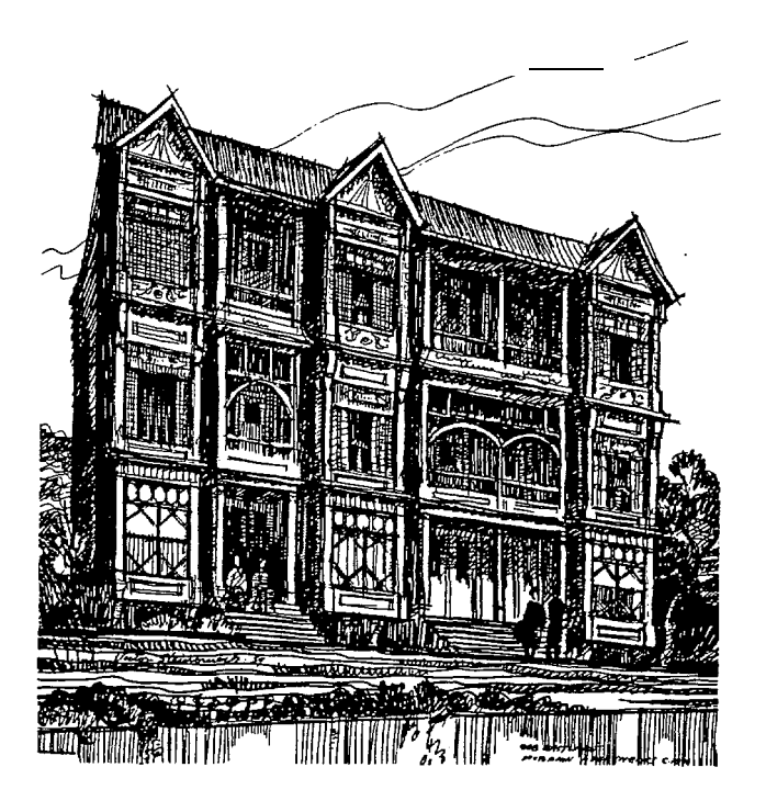
Apartment building at 908 Eastlake Avenue that was demolished for I-5 construction. Drawing by Victor Steinbrueck (used by permission of Marjorie Nelson Steinbrueck).